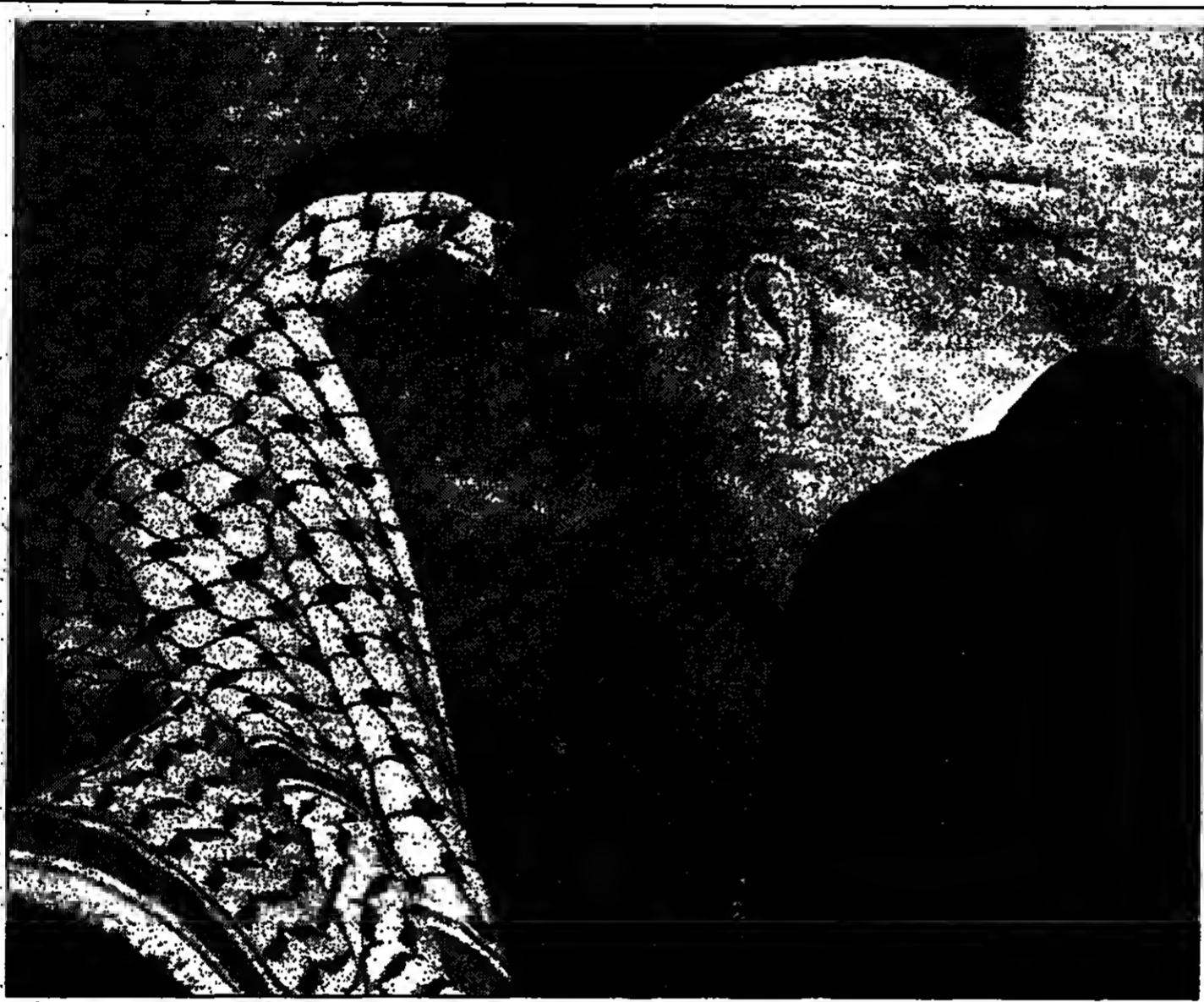
Kisses in the Kremlin Palestinian Authority Chairman Yasser Arafat gives Russian President Boris Yeltsin a kiss on the forehead prior to their talks in the Kremlin yesterday as part of Arafat's two-day visit to Moscow.